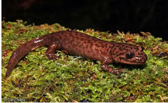
Pasche's Giant Salamander (Chinese)