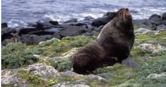
Northern Fur Seal