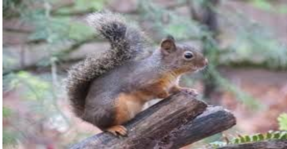
Northern Flying Squirrel