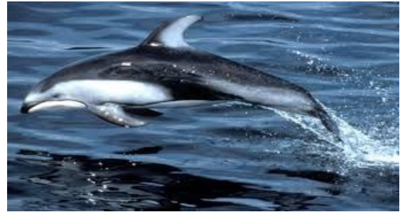
Pacific White-sided Dolphin