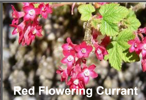
Red Flowering Currant